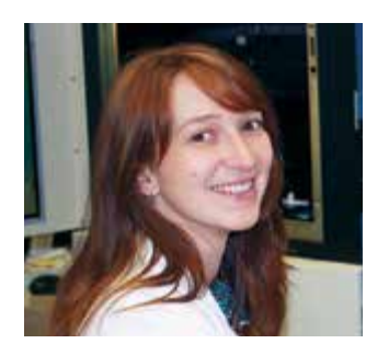
DOCTOR OF PHILOSOPHY (MOLECULAR AND CELL BIOLOGY) GRADUATE

With unrivalled research expertise and an international reputation for excellence, UQ provides every advantage to succeed during your Doctor of Philosophy (PhD) or Master of Philosophy (MPhil). Our bright minds come from all walks of life, with expertise in all aspects of health.