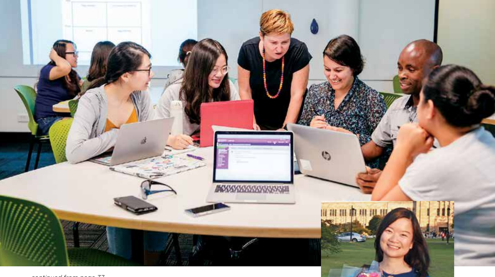
continued from page 37