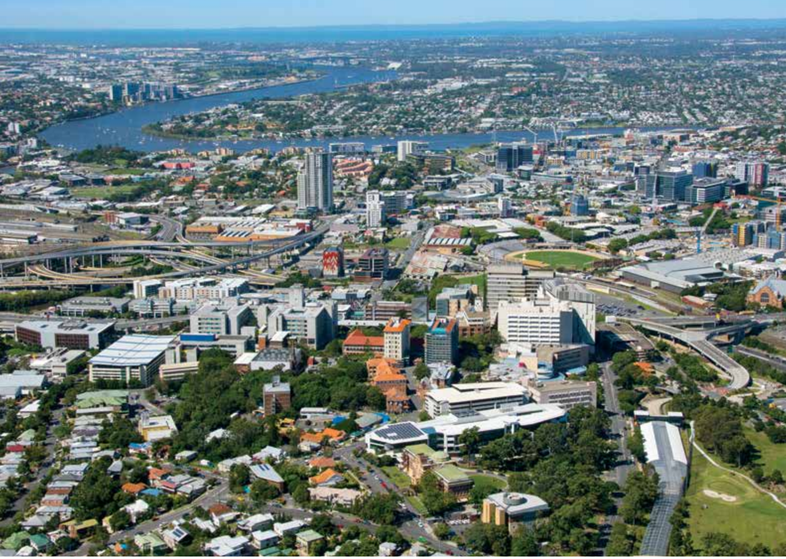
An aerial view of UQ Herston campus